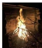
"Your hand held high and your soul as open doors. And feel the warmth that makes you free..."