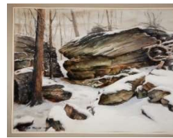
#3 Mosquito Rock

Yes, I would like to order _____ 8 x 10 prints at $5 each or _____ set(s) of 3 at $12 per set.