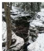
"Easy come, easy go through summer & through snow. Up & down, all around this winter I go."