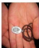
"I've got that Christopher Spirit all over me. The get it all over me to stay."

2. Our Christopher Spirit series of note cards features 6 different photos by 6 Camp alumni along with a lyric fragment from a familiar camp tune. Blank on the inside for your personal thoughts and messages, the cards come as sets of 6 for the modest price of $5 per set.