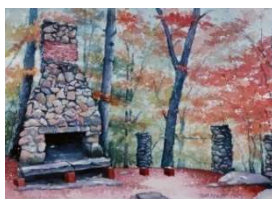
#1 Old Man's Cabin