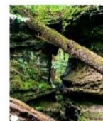
"I love the rocks and hills, the woods and camped hills. My heart with nature fills..."