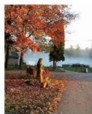
"When there's danger to life, let us bring hope. Where there is darkness, only light."