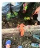
"Praise Him wherever you find Him. In anything made."